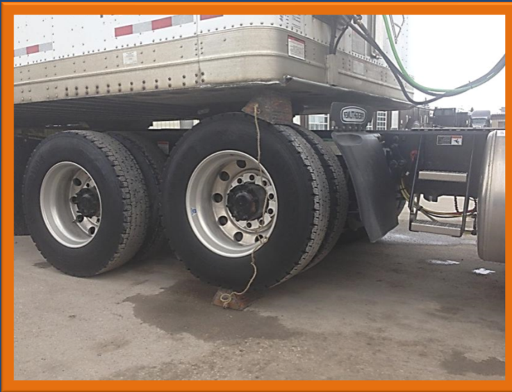
Improper Wheel Blocking

Once backed in, apply parking brakes to secure the vehicle. Before any loading or unloading, properly position wheel blocks!