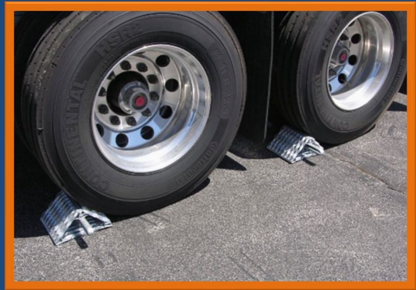
Proper Wheel Blocking