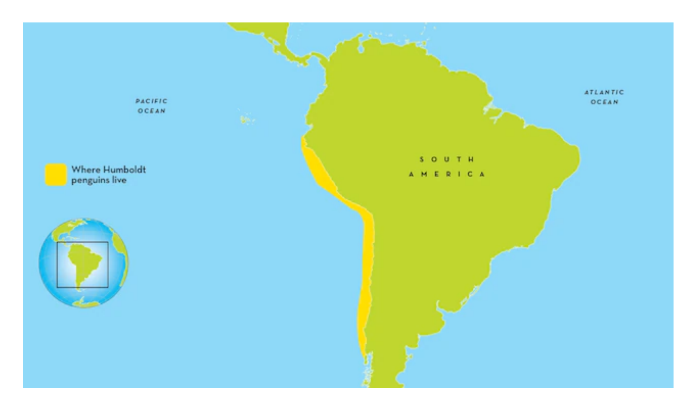
Check out where Humboldt penguins live.